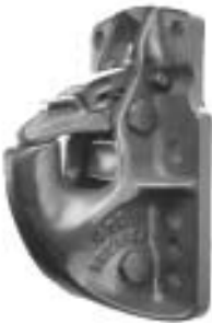
Kit # 470A