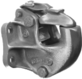
Kit # 270A